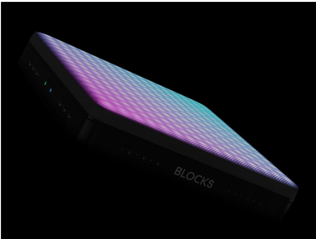
The Lightpad Block