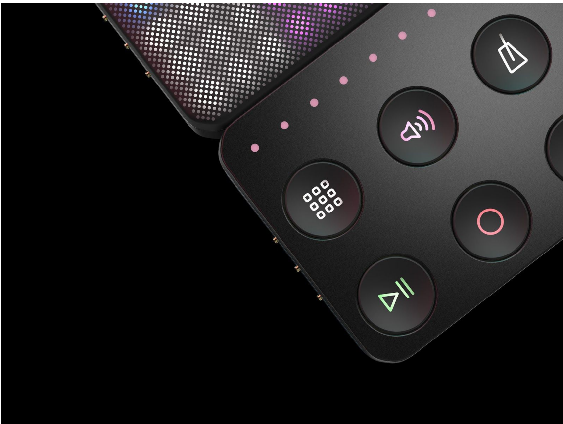
The Lightpad Block connected to the Loop Block