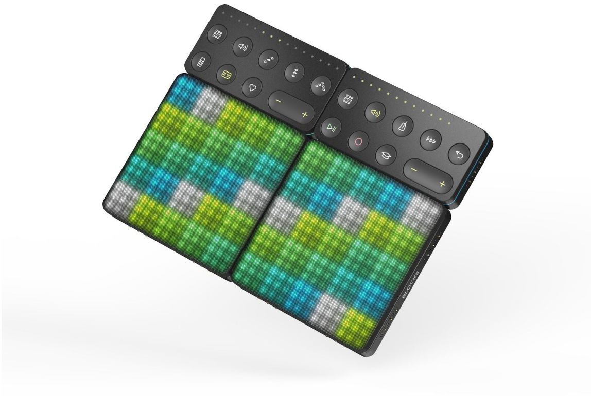
Lightpad Blocks connected to the Live Block and Loop Block