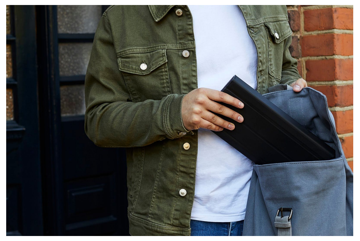
Compact and weighing less than an iPad Pro, LUMI Keys can travel anywhere