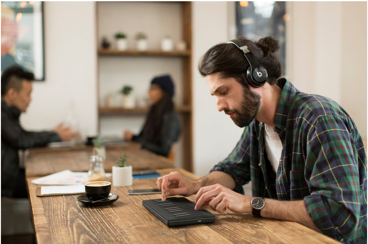
Play Seaboard Block anywhere you make music.