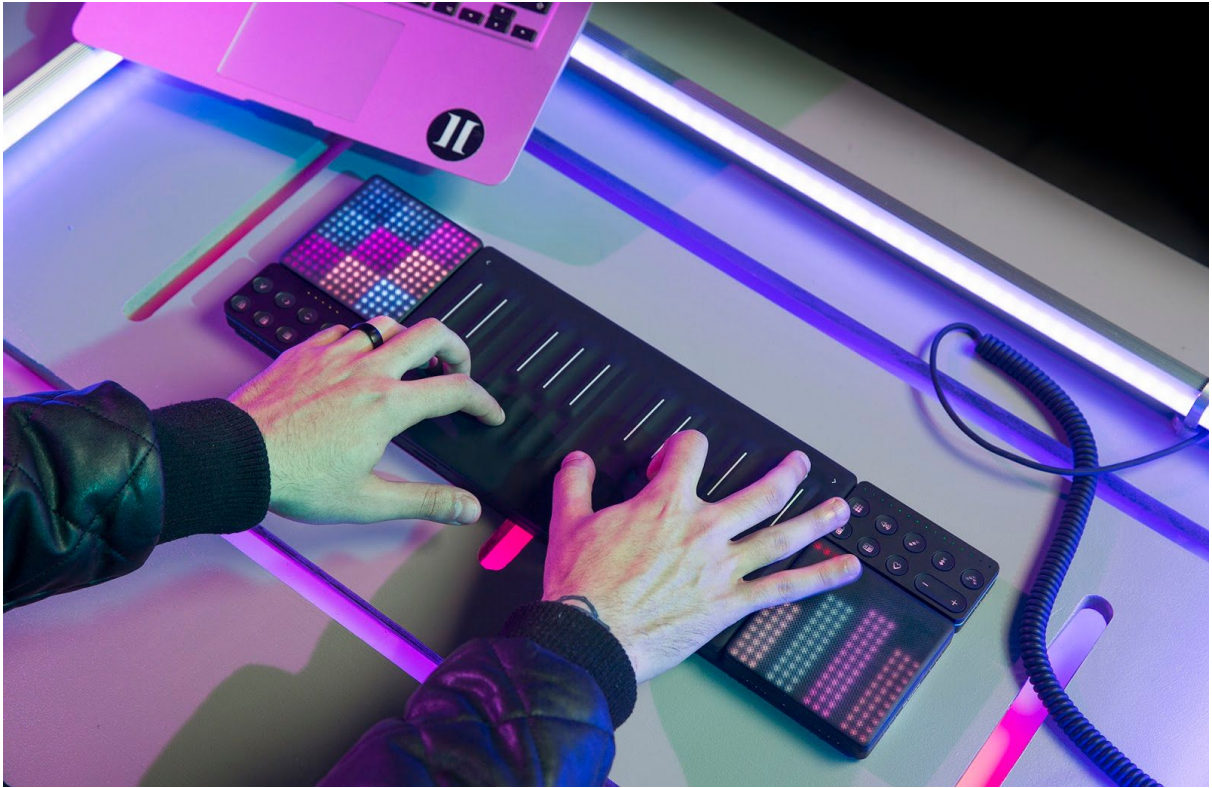
Build your instrument: Seaboard Block connected to two Lightpad Blocks, a Touch Block, and a Live Block.