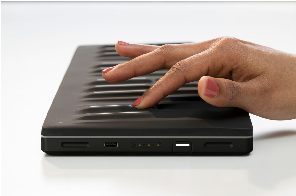
Press into the silicone surface of Seaboard Block to deepen sounds.