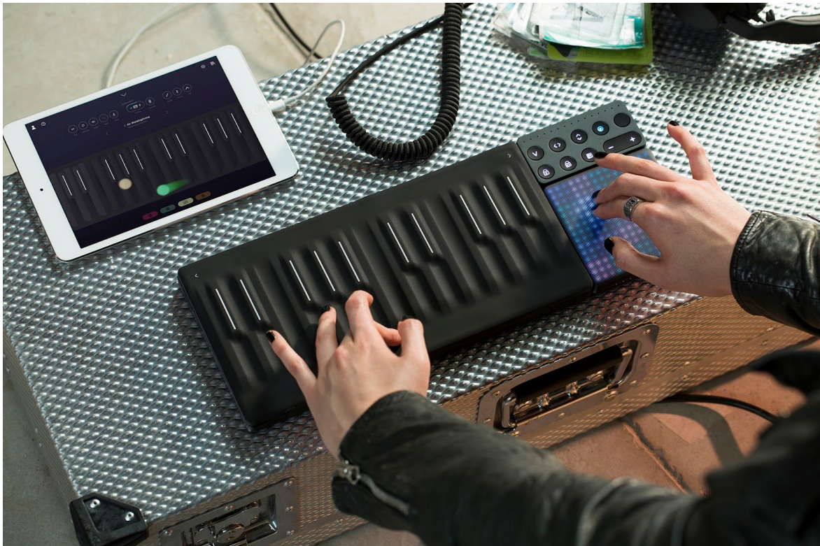
Seaboard Block connected to Lightpad Block and Touch Block, powered by NOISE on iPad.