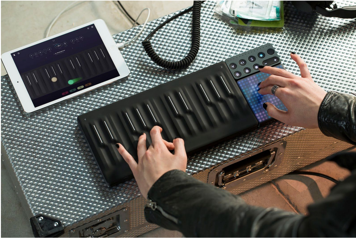
Seaboard Block connected to Lightpad Block and Touch Block, powered by NOISE on iPad.