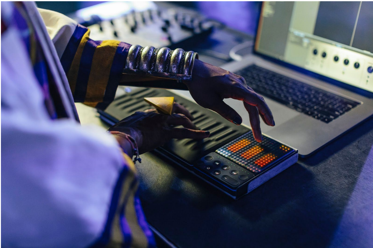
Musicians for the first time can perform with the hundreds of expressive sounds in GarageBand, which now has a deep integration with the Songmaker Kit.