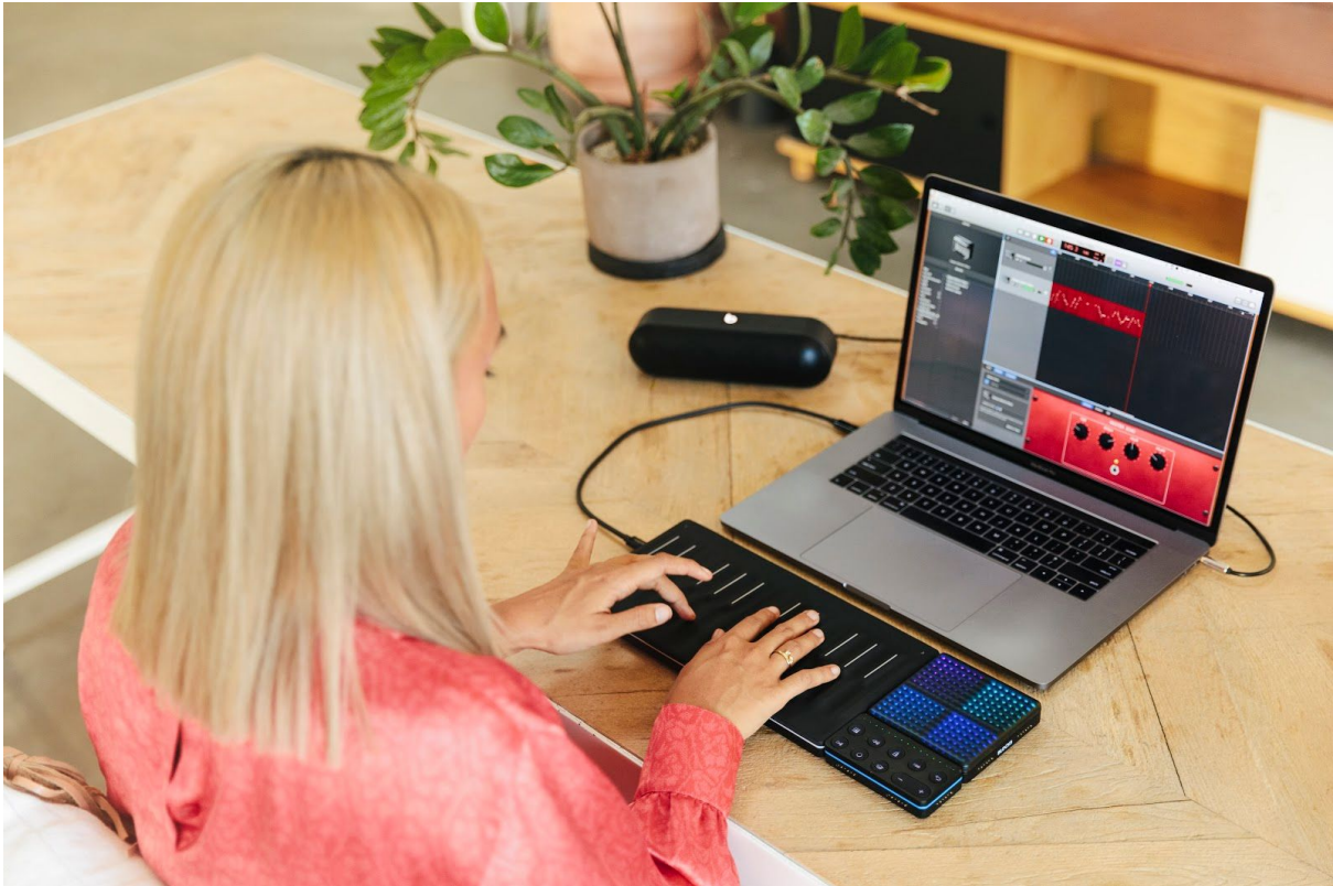
Music makers can directly control all GarageBand's production features from the Seaboard Block, Lightpad Block, and Loop Block.