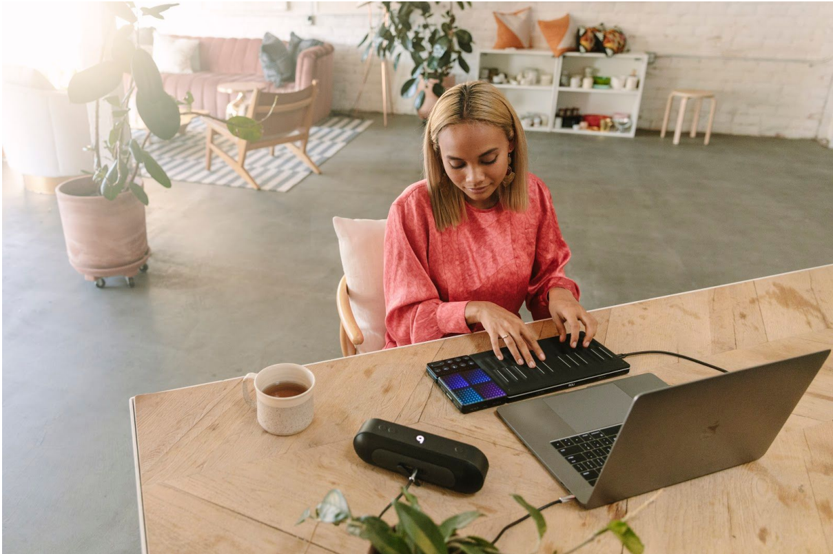
Songmaker Kit GarageBand Edition features a deep integration between ROLI's Songmaker Kit and GarageBand for macOS.